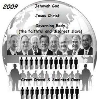
The Ladder of Authority