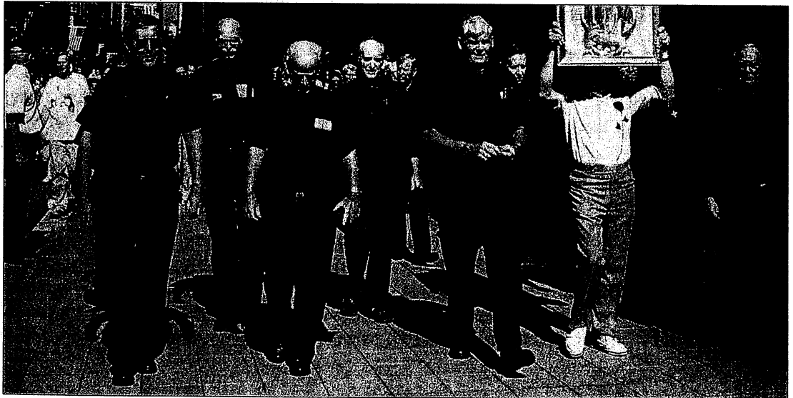
Cover and above: Eleftherios/Sipa Press

According to its survey, 91 percent of Catholics agree with the use of artificial birth control even though their church condemns it; 78 percent think women should be allowed to become priests; and